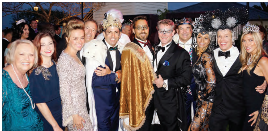
Royal Ball attendees are dressed to impress